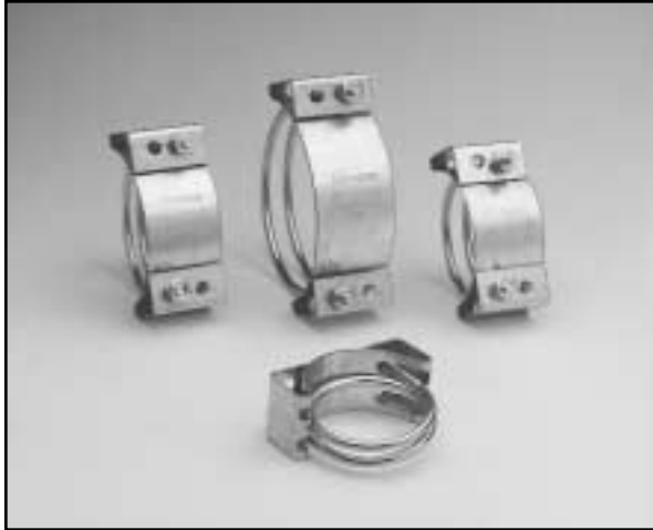
Hose Clamps Galvanized steel saddle, nuts and washers with electroplated, spiral thread bolts.

Morris MORR-TITE Spiral Double Bolt Clamps For Corrugated Material Handling Hose.