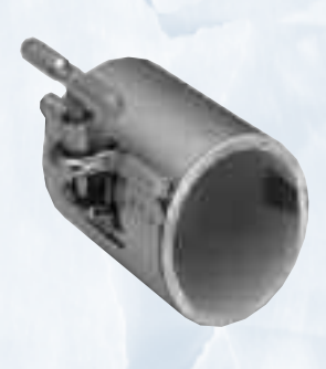
(Single and Dual)